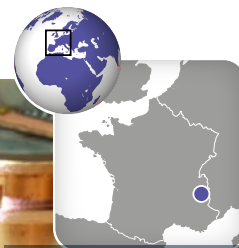
Fréjus Tunnel, Modane depth: 1.7km