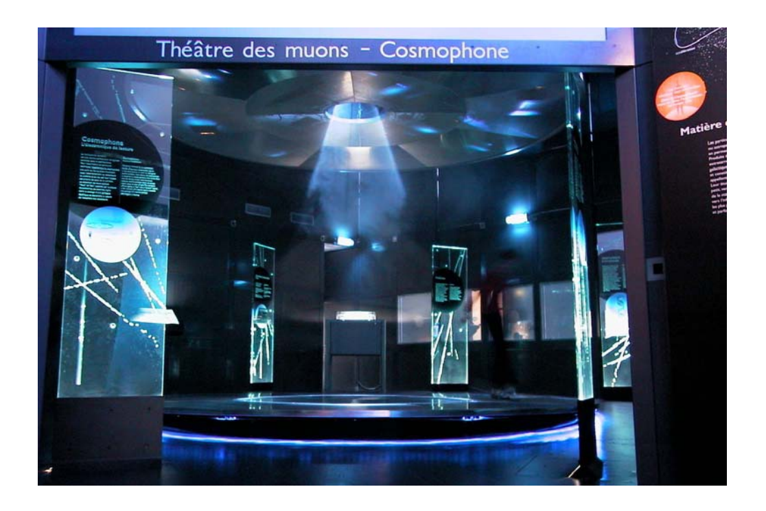
Figure 3: the cosmophone built for the Cité des Sciences et de l'Industrie in Paris

In such an installation, the choice of sound as a medium is essential for several reasons. First of all, sound is transmitted as a mechanical vibration, providing a direct contact with the distant phenomenon. The moderate ability of the ear to locate sound sources is also well matched to the rather coarse space sampling allowed by simple particle detectors and loudspeakers. Finally the present sophistication of numerical sound synthesis techniques allows a flexible real-time three-dimensional imaging of particle properties. Such an environmental reproduction is essential to the emotional impact of the physics phenomenon. These principles could be extended to the reproduction of many other physics processes.