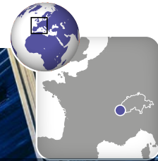
LHC (CERN), Geneva depth: 100m

CP mixing and violation in the quark sector