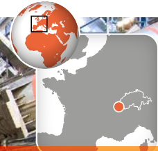
LHC (CERN), Geneva depth: 80 m