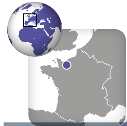
SPIRAL2 installation at GANIL, Caen, Normandy